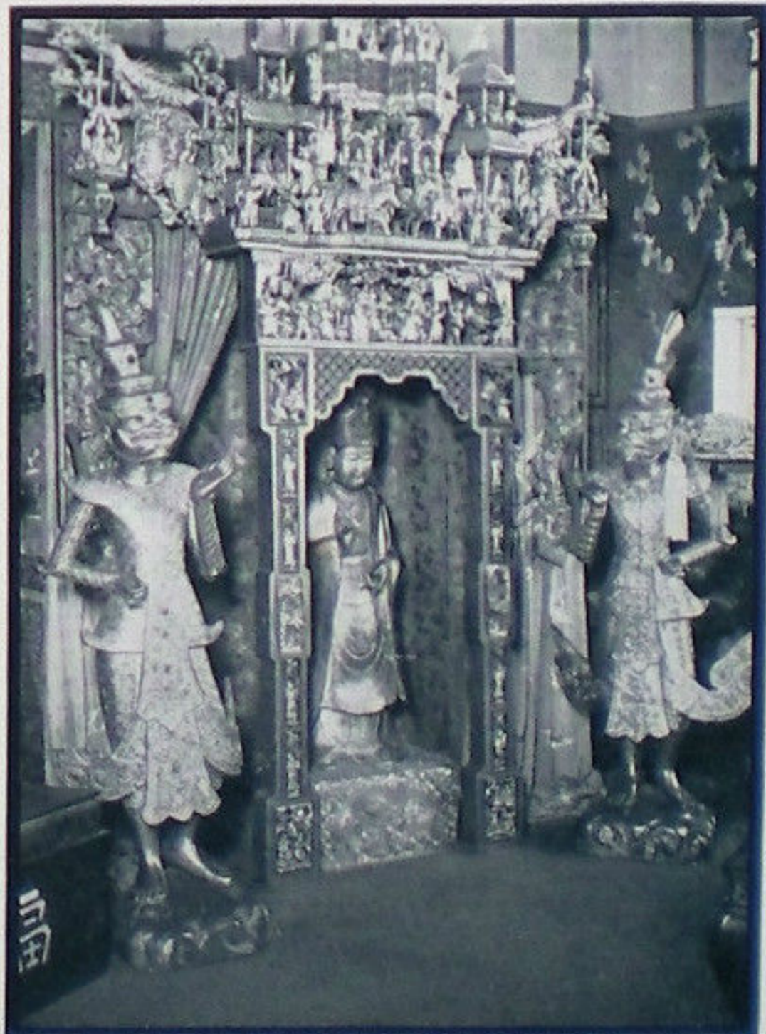
"HERE STANDS THE DOOR TO WHICH THERE IS NO KEY"